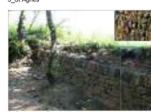
6_Godrevy to Portreath