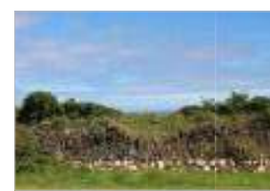
2_Pentire Point to Widemouth