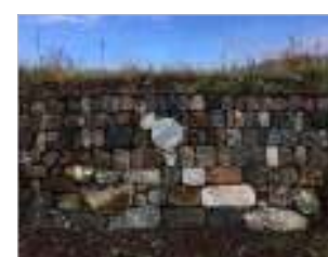
8_South Coast - Western