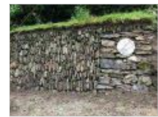
10_South Coast - Eastern