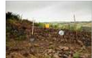
9_South Coast - Central