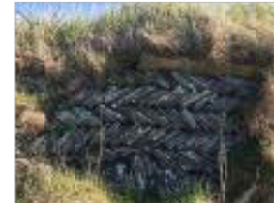
4_Trevoze Head to Stepper Point